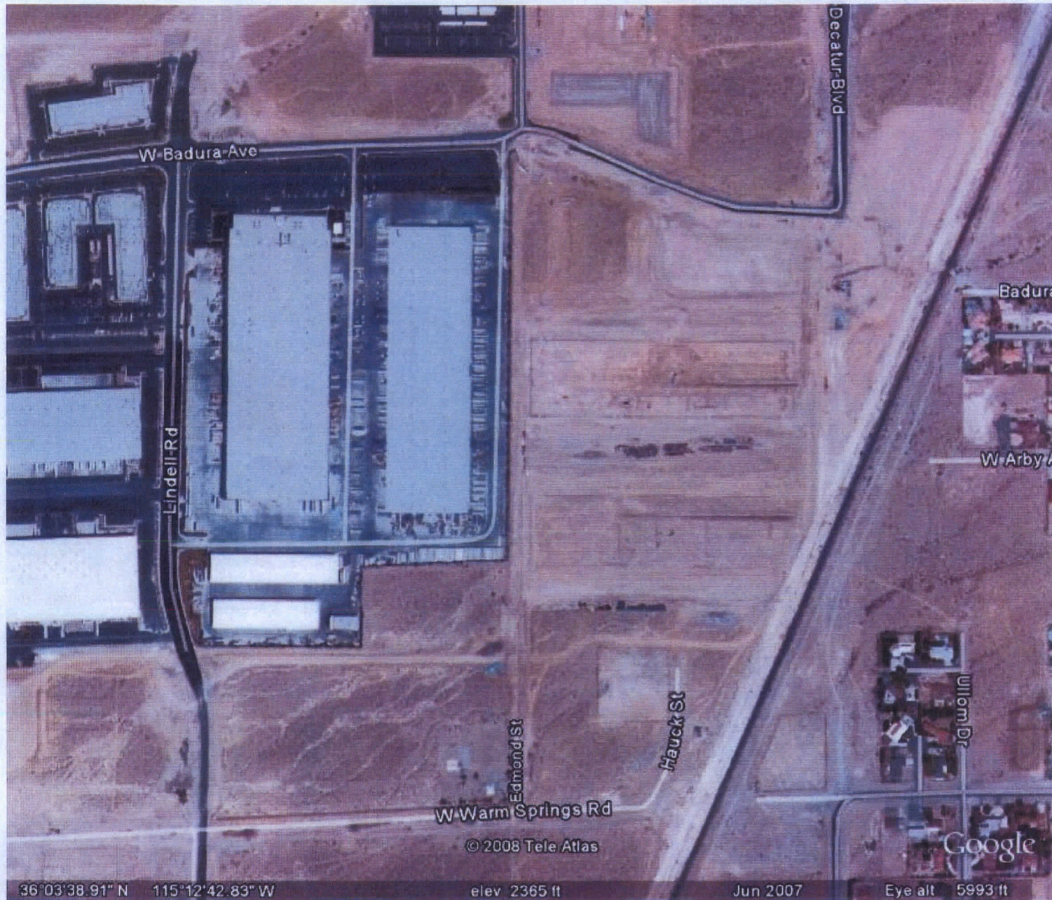
Switch Business Solutions, LLC ROW License Agreement Area Boundary of Lindell Rd., W. Badura Ave., S. Decatur Blvd. and W. Warm Springs Rd.